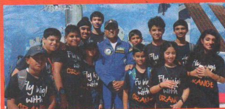
The winners of NAO with ASTRONAUT RAKESH SHARMA at NASA